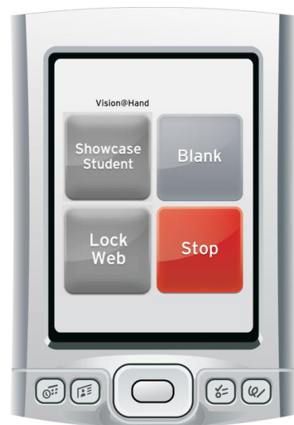
Vision@Hand (PDA not included)

Vision@Hand provides a simple, easy-to-read interface that allows you to see what actions are currently in use. It can be used with a wide variety of web browsers that allow the user to navigate to the teacher's computer from a PDA or other mobile device.